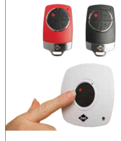
B&D Power Drive includes: 2 x Tri-Tran+™ Premium Remote Controls and Wall Mount Remote Control.